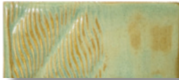
TD506 • Lichen Green