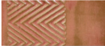
TD509 • Rose Gold