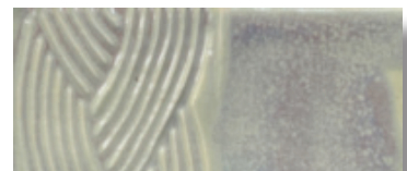
TD510 • Halo Purple