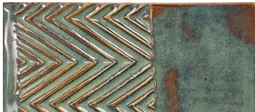
TD502 • Galaxy Blue