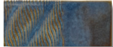
TD504 • Blue Dusk