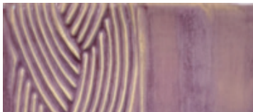
TD511 • Purple Velvet