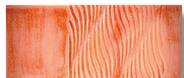
TD513 • Orange Neon