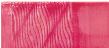
TD508 • Cherry Fizz