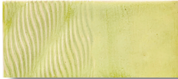
TD512 • Pistachio